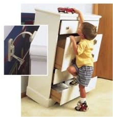
All furniture over 27-inches will be sold with safety straps to anchor furniture to the wall safely. We will provide safety straps for your items when you drop it off at the JBF sale.