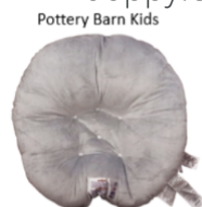
Pottery Barn Kids